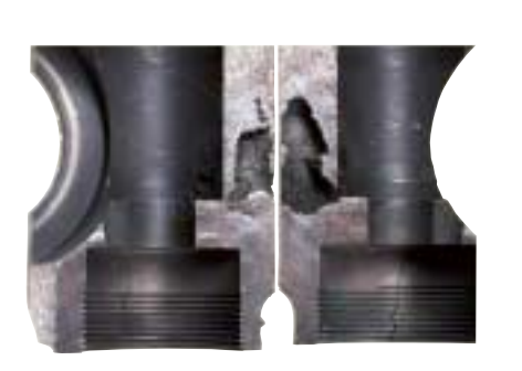
Short life. Adjuster housing copy: broke after 45,000 applications in a fatigue test. Note cracks and porosity defects. In the same test, a Haldex original lasts 800,000 applications – minimum..