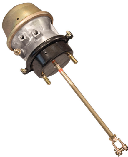
Original, flat bottom housing 3.43mm (.135 in) thickness